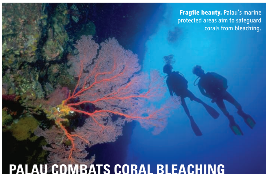
Fragile beauty. Palau's marine protected areas aim to safeguard corals from bleaching.