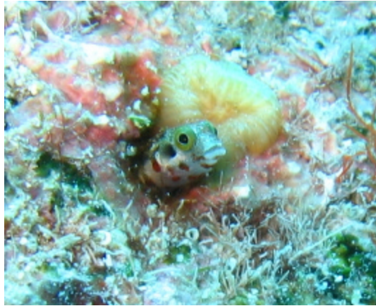
Fish and Coral recruit on reef ball