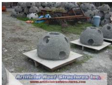
(links courtesy of artificialreefs.org)

Over 500,000 Reef Balls have been deployed in over 3,500 projects worldwide making Reef Balls the most widely used designed artificial reef in the world. On average, each of these Reef Balls produces up to 180 kilograms (400 lbs) of bio-mass (animal or plant life) annually and Reef Balls have an expected life of at least 500 years. Which means... roughly 9 Billion kilograms of biomass will be added to the worlds oceans over the next five centuries as a result of Reef Ball efforts.