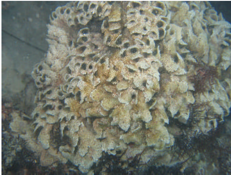
Sabellariid worm rock (A rare reef building worm species growing directly in a whirlpool creating hole of a single Reef Ball off Gran Dominicas)

Finding this worm rock aside heathy Acropora Palmata (Elkhorn Coral, pictured below) means the site has a very rare combination of high water quality and coastal sediments. [Elkhorn requires the highest water quality and typically non-turbid sediments unless the grain size is large enough not to impair feeding. Worm rock requires sediments to be pulled from the water to build the hard skeleton it mixes with a kind of biological glue. Neither of these species would be likely to survive in this area with the assistance of the Reef Balls. ]