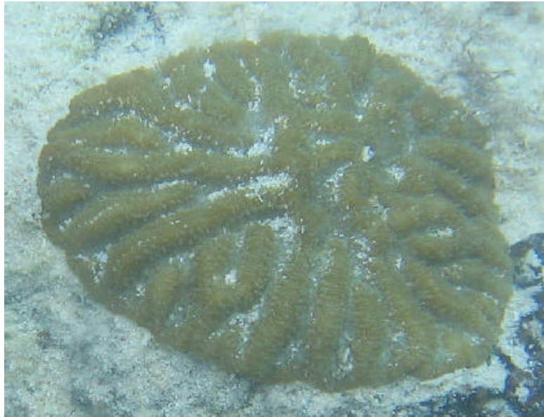
Maze Coral ( Meandrina meandrites ) (Visual ID only)