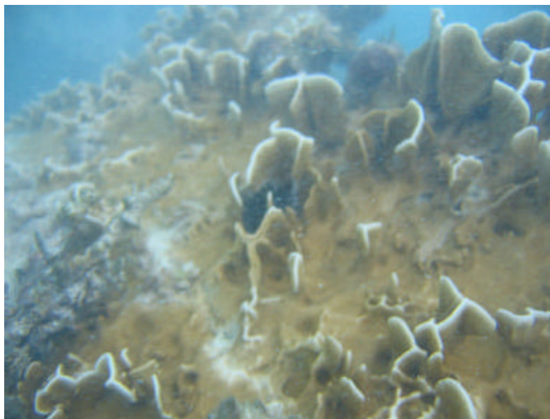
Blade Fire Coral ( Millepora complanata )