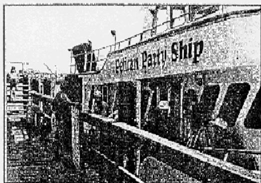
Awaiting shore-off time on the morning of July 21.