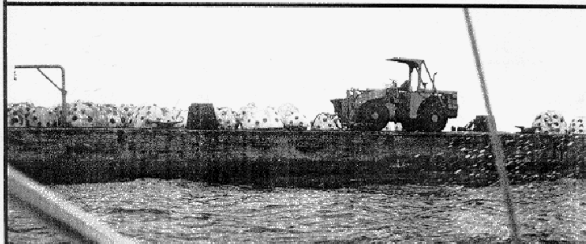
Fish condos ready to go down!

See pages 22-23 for more Reef Ball information and pictures.