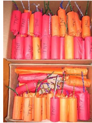
"Firecrackers" made by Country Crossroads 4-H Club

During the summer, not all Martin County 4-H Clubs were idle and enjoying the lazy days. The teens in the Country Crossroads 4-H Club were hard at work on their community service project. Using toilet paper tubes and paper towel tubes, they made "firecrackers". Inside each one they put sample sizes of shampoos, lotions & candy, then wrapped in red tissue paper with a 'tinsel' fuse. Then they delivered them to a local nursing home for distribution to residents that seldom receive visitors or gifts. It was a fun project and the Club would like to do it several more times throughout the year. The club needs donations of small items to stuff inside to continue their project. Can your club donate some "stuff"? Bring it by the 4-H office and the office staff will make sure it get to the club.