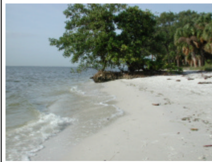
Black mangroves along southeastern shoreline, roots exposed, will be dislodged/toppled soon.

Erosion of the shoreline in the area around the Gadsden Point site resulted in the discovery of Native American remains around 1994. Continued erosion of the shoreline around the Gadsden Point site could result in exposure of more archeological resources. The site contains important Native American burial remains and middens that may experience new exposure almost daily.