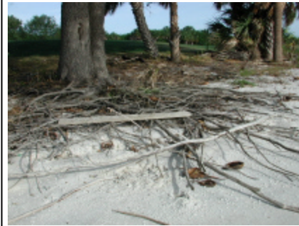
Exposed roots of "historic" Live Oak along southeastern shoreline. Oaks will be lost soon.

northern portion of the southeastern shoreline area that is rapidly eroding.