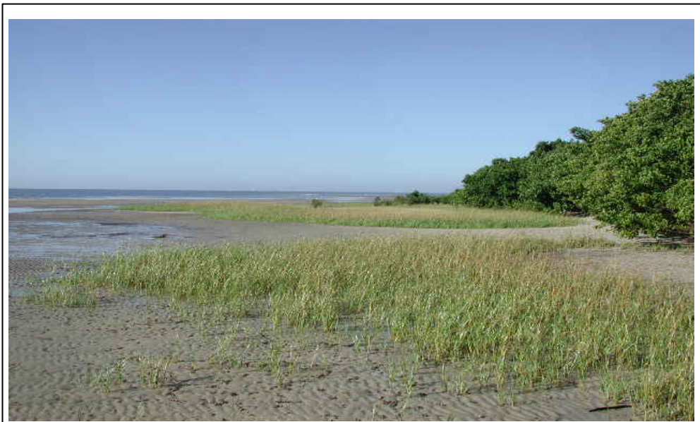
Southern shoreline at low tide. Sea grass recruitment occurs naturally in this area due to low wave energy.