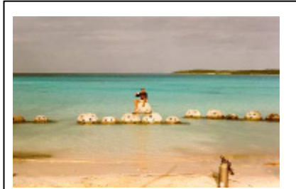
Photo showing a similar Reef Ball barrier in shallow water environment.

A smaller version of the Reef Ball shown in the photo would be used for the demonstration project. The "Lo Pro Reef Ball" is about two feet wide at the base and one foot tall and weighs about 75 pounds. These reef balls are well suited for the establishment of oyster and mussel beds that are common throughout Tampa Bay and along MacDill's shoreline. Placing the reef balls in approximately two feet of water would allow the balls to be mostly exposed during low tide and totally submerged at high tide, conditions which are generally suitable for oysters and other mollusks.