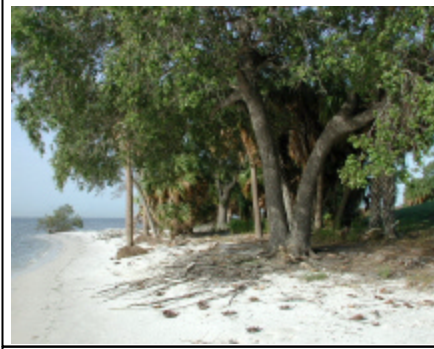
Shoreline erosion has imperiled several old (100+ years) Live Oak trees.

The base currently has no funds to support erosion control in this area. MacDill has programmed for Conservation funding for fiscal years 2002 through 2005 but has not yet received funding. The base has also applied for a Legacy Fund grant. The Legacy Fund is a Department of Defense fund dedicated toward implementing valuable natural and cultural resources projects.