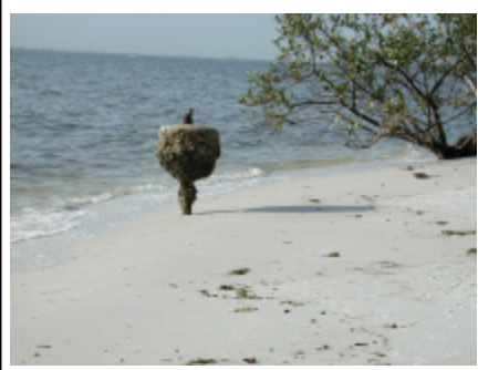
Old fence post with concrete footer shows amount of erosion that has occurred.

The southeastern shoreline along MacDill AFB is rapidly eroding. The rate of erosion has been estimated to be approximately one foot per year. Shoreline erosion may be due to a number of factors including an increase in the size and volume of commercial ship traffic through Hillsborough and Tampa Bays.