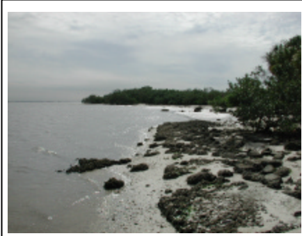
Looking south at northern portion of MacDill's southeastern shoreline, site proposed for demonstration project.

typically 1.5 to 2.0 feet deep at high tide (see attached bathometric survey of demonstration site).