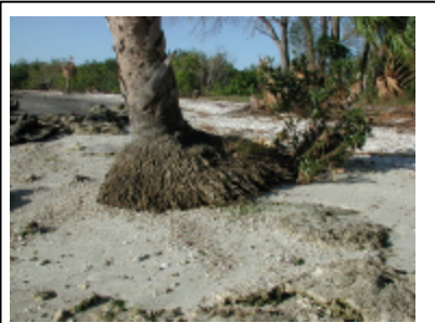
Erosion exposing roots of palm tree.

Cultural resources benefits include preservation of an eligible-for-listing archeological site where native American remains have been exposed in the past as a result of shoreline erosion.