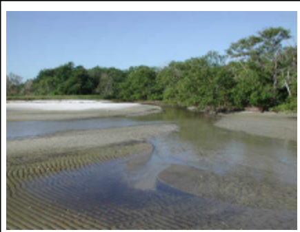
Restored mangrove shoreline just south of demonstration site.

Natural resources benefits of the project include the preservation of an undeveloped coastal shoreline and the associated ecosystems. The project would preserve critically imperiled natural shoreline, threatened and endangered species habitat, and related wetlands. This shoreline is contiguous to critical habitat of the East Indian manatee ( Trichechus manatus ) and others.