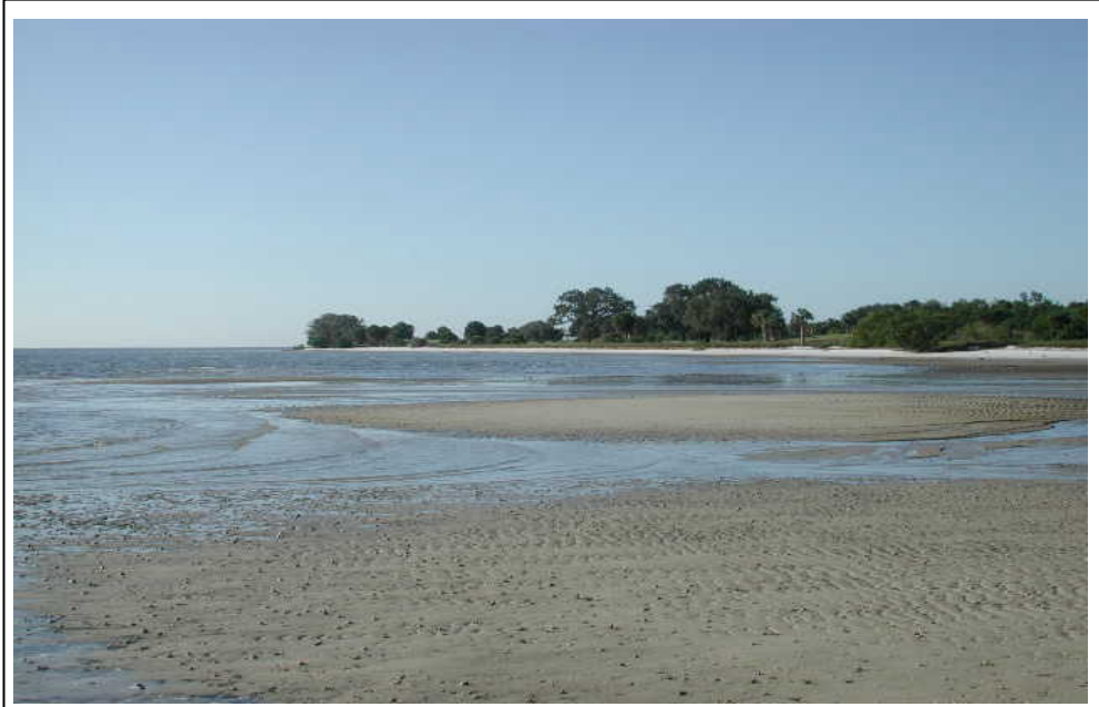
Southeastern shoreline at low tide. No recruitment of sea grasses along this area due to shoreline erosion.