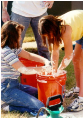
Girls are up to their elbows in plaster of Paris The stuff of which model Reef Balls are made!