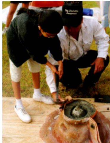
Boys strike a blow for reef preservation and conservation.