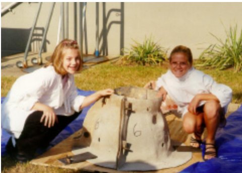
Students put the molds in place

The kids made the front page! Read more about this project in the Brunswick News article by Amy Horton.