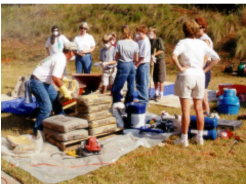
Double bubble, toil and trouble... mixing Reef Ball concrete