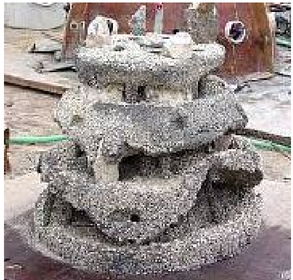
Figure 1. Traditional Reef Ball™ Unit (L) and “Layer Cake” Reef Ball Unit (R)