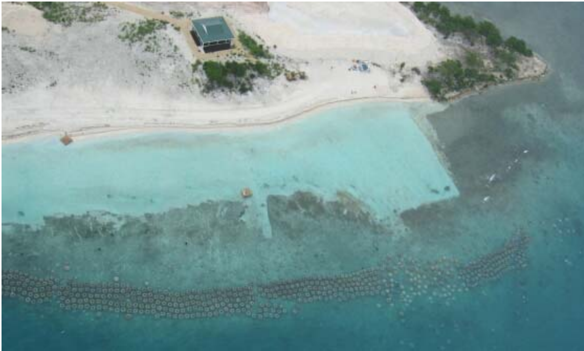
Figure 14. Aerial Photograph of 5-Row Reef Ball Breakwater in Antigua The breakwater also incorporates snorkel trails, swimming and diving areas.)

For recreational enhancement, artificial reef units can be designed as snorkel and diving trails. Figure 14 shows a 5-row submerged breakwater being completed in Antigua, which has gaps and special areas designed for use by swimmers, snorkelers and divers.