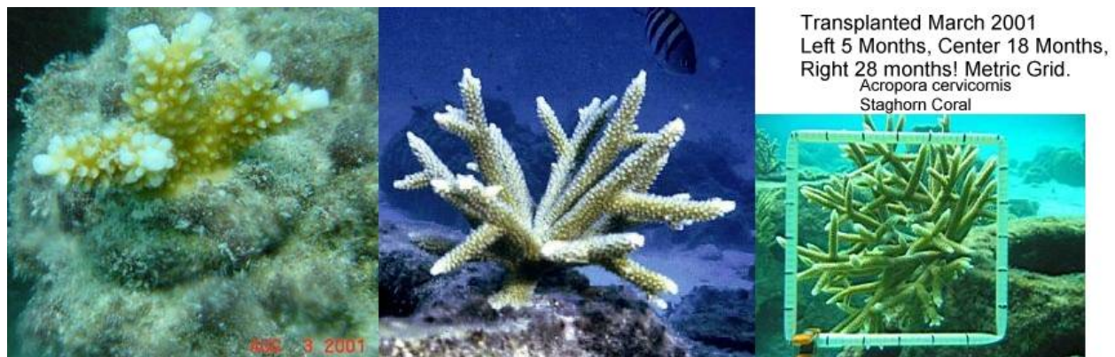
Figure 11. Staghorn Coral Propagation Growth in Curacao (Reef Ball Foundation)