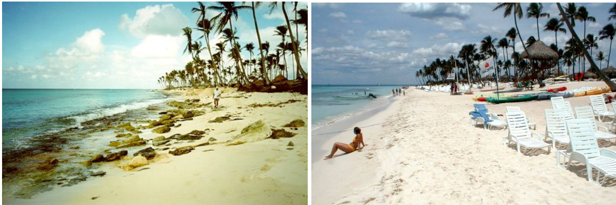
Figure 6. Increased Beach Width at Gran Dominicus– 1998 (Left) to 2001 (Right)

Other Reef Ball submerged breakwaters have been constructed in other parts of the Caribbean including the Cayman Islands, shown in Figures 7-9. This 5-row submerged Reef Ball breakwater is located offshore of Seven Mile Beach on Grand Cayman Island. The breakwater reef units have remained stable during waves from major hurricanes, including the direct hit by Category 5 Hurricane Ivan in 2004 and large waves from Category 5 Hurricane Wilma in 2005.