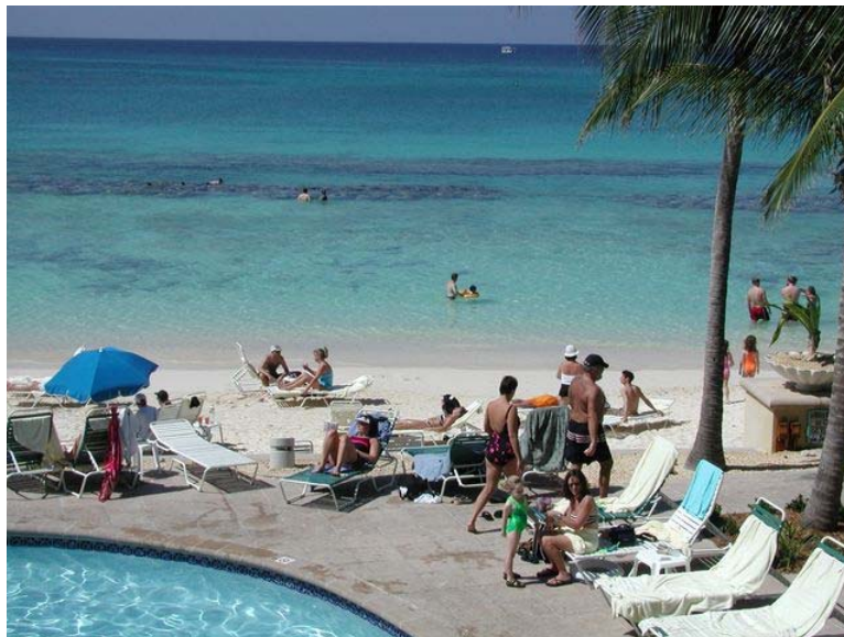
Figure 9. View of Reef Ball Reef offshore of the Grand Cayman Marriott