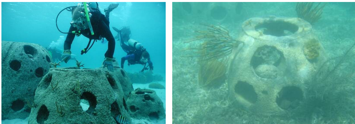
Figure 10. Coral Transplants and Propagation

In addition to the natural marine growth, hard and soft corals can be transplanted and propagated on artificial reef units. The artificial reef units provide stable bases upon which coral can be attached, as shown in Figure 10. Corals can be moved from areas that have been or will be damaged from ship groundings, storms, dredging or other natural or man-made activities. Figure 11 shows Staghorn coral growth on Reef Ball artificial reef units in Curacao, and Figure 12 shows the rapid growth of Acropora corals propagated on the Reef Ball breakwater units in Antigua (both sites in the Caribbean). Natural coral growth on a Reef Ball unit in Indonesia after five years is shown in Figure 13. Artificial reefs can be used for aquaculture applications, including fish and lobsters.