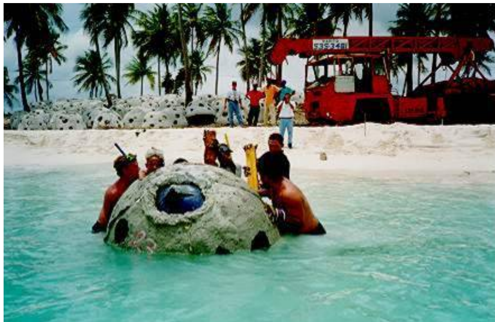
Figure 3. Deployment by Floating Reef Ball Units from Beach

Concrete is poured into the top of the assembled mold shown on the left, and after hardening, the mold is removed as shown on the right.