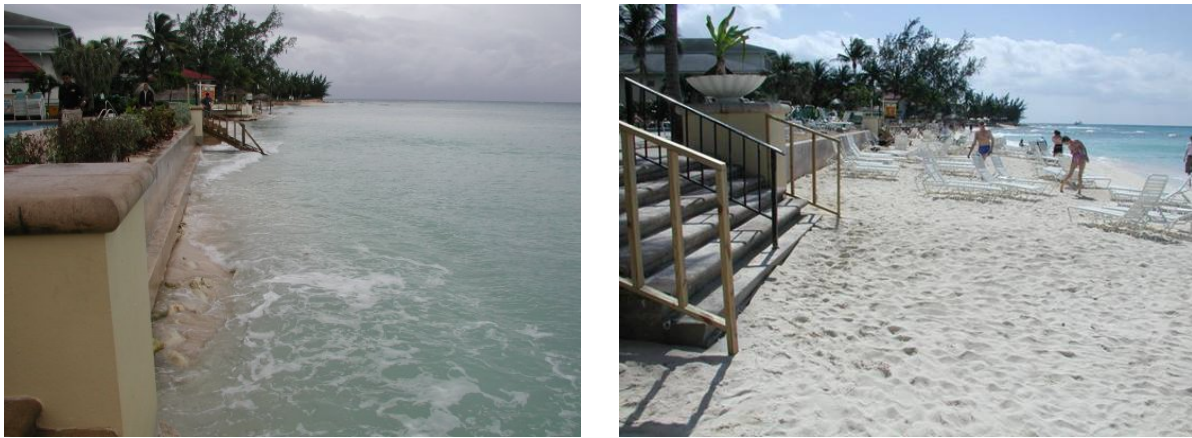
Figure 8. Marriott Beach Before (L) and After (R) Reef Ball Breakwater Installation