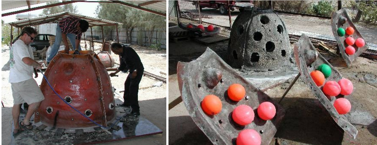
Figure 2. Traditional Reef Ball Unit Mold Fabrication

Custom designed artificial reef units such as the Reef Ball™ have been designed to attract and provide habitat for fish, lobster, and other marine life. Each Reef Ball artificial reef module on average produces about 180 kilograms (400 lbs) of biomass annually. A special concrete mix was developed that allows the Reef Ball modules to be deployed within 24 to 48 hours of being fabricated, and with special formulations that reduce the concrete pH to match that of natural seawater. The pH balancing and unique textured surface of the Reef Ball modules ensures that coral larvae and other marine life can easily attach to the modules to develop into a natural biological reef.