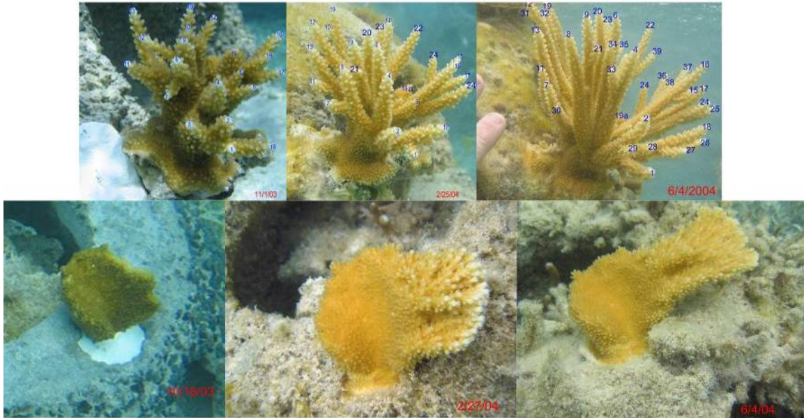
Figure 12. Coral Propagation Growth on Reef Ball Breakwater (Reef Ball Foundation) Coral plug growth from November 2003 to June 2004 in Antigua.