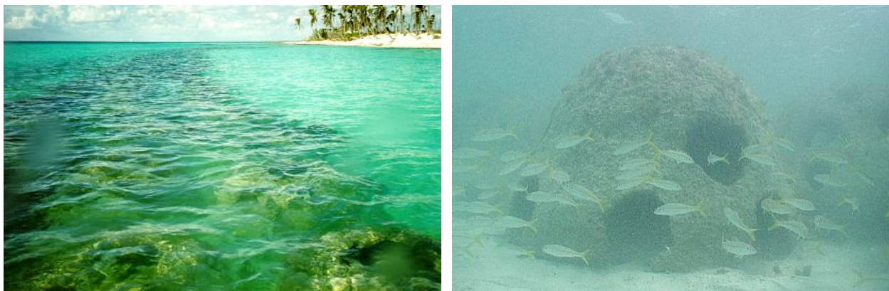
Figure 4. Gran Dominicus 3-Row Reef Ball Submerged Breakwater (Harris, 2003)

The first submerged breakwater project constructed using Reef Ball™ artificial reef units was along the southern Caribbean shore of the Dominican Republic during the summer 1998. Figure 4 shows the three-row Reef Ball submerged breakwater. Approximately 450 Reef Ball™ artificial reef units were installed to form a submerged breakwater for shoreline stabilization, environmental enhancement and eco-tourism. The individual units used for the breakwater were 1.2m high Reef Ball™ units and 1.3m high Ultra Ball units, with base diameters of 1.5 and 1.6 meters, respectively, and masses of 1600 to 2000 kilograms. The breakwater was installed in water depths of 1.6m to 2.0m, so that the units were 0.3m to 0.8m below the mean water level (the tide range in the project area is approximately 0.4m).