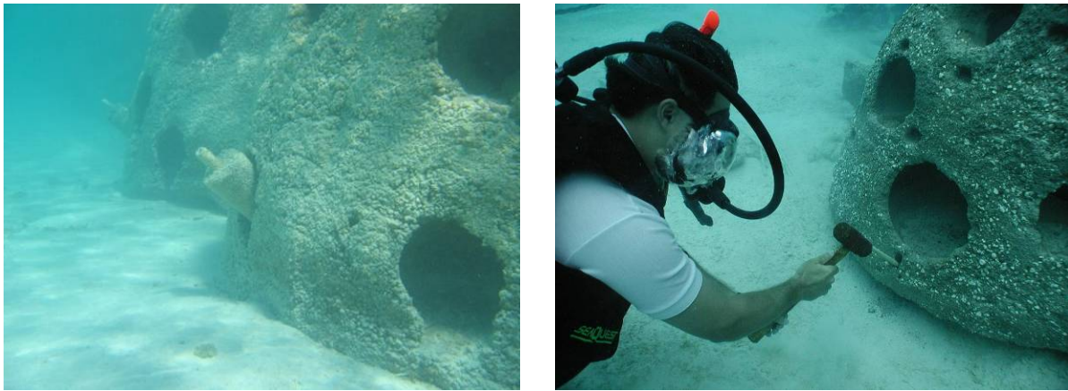
Figure 15. Pilings (left) and Rods (right) into Sea Bottom through Reef Ball Units