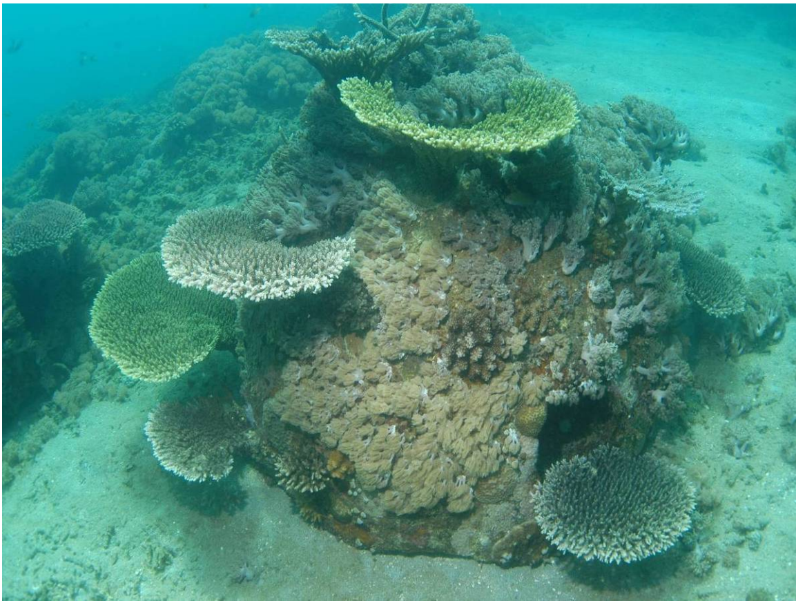
Figure 13. Coral Growth on Reef Ball after 5 Years in Indonesia (Reef Ball Foundation)