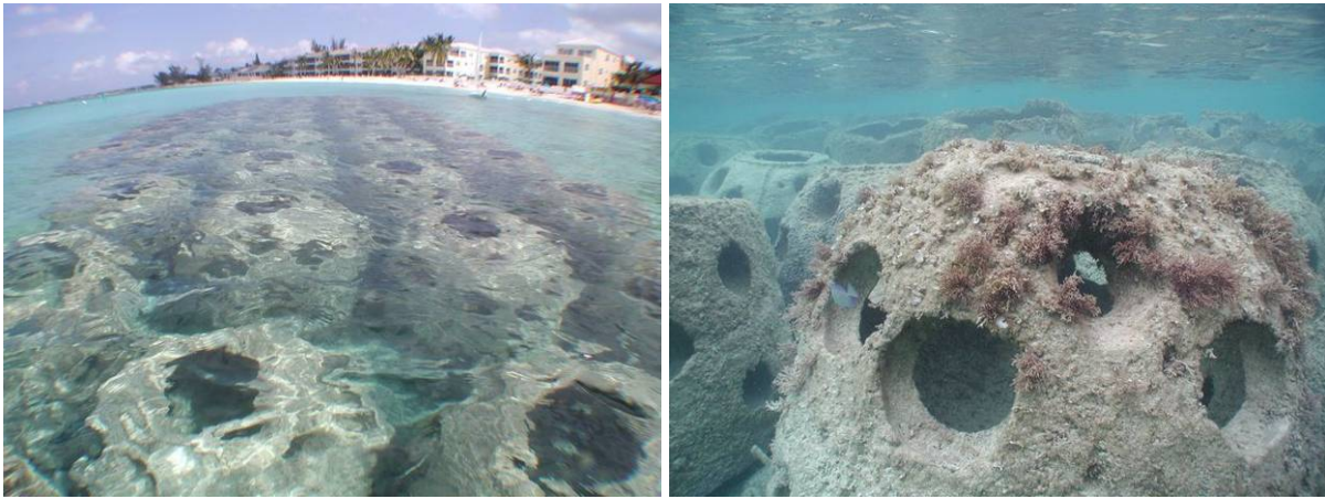
Figure 7. 5-Row Reef Ball Submerged Artificial Reef Breakwater offshore Grand Cayman