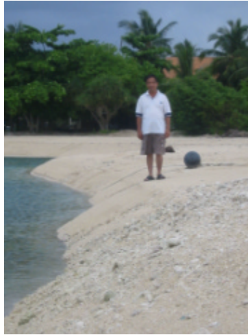
Photo showing steepness of western side of spit channel, looking north to the island.