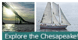
Explore the Chesapeake!