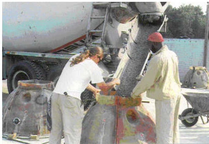
Reef Ball Construction at Delmont State Correctional Facility

Seven hundred reef balls have been constructed at Southern State Correctional Facility at Delmont and are ready for deployment on August 17, 2006 ( POSTPONED - DEPLOYED ON AUGUST 23 ), at the Townsends Inlet Reef Site located 3.8 miles southeast of Townsends Inlet, as part of the division's Artificial Reef Program . The reef balls will soon be homes for more than 150 species of fish and marine life.