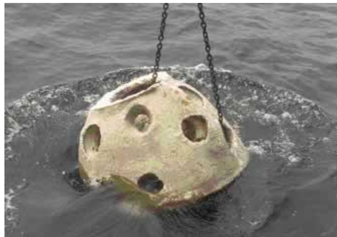
Reef Ball Deployment

The 700 reef balls will be deployed at the inshore drift-fishing portion of the reef. The deployment date is subject to weather and sea conditions. For further information on this deployment contact Hugh Carberry at 609-748-2022.