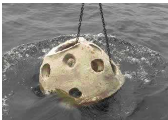
Reef Ball Deployment

The 250 reef balls will be deployed at the northeast portion of the reef. The deployment date is subject to weather and sea conditions. For further information on this deployment contact Hugh Carberry at 609-748-2022.