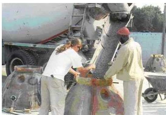
Reef Ball Construction at Delmont State Correctional Facility

Two hundred and fifty reef balls have been constructed at Southern State Correctional Facility at Delmont and are ready for deployment on September 7, 2007 at the Wildwood Reef Site located 4.5 miles southeast of Hereford Inlet, as part of the Division's Artificial Reef Program . The reef balls will soon be homes for more than 150 species of fish and marine life.