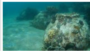
&2857(6< 3+2 726

VMWV HMLU \RXQ P RYP HQDQRRI VMH QDQURVMWV HMLU DQGGRIURV