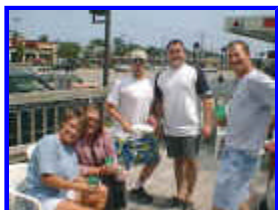
Our faithful HH Members, Thanks for your support!