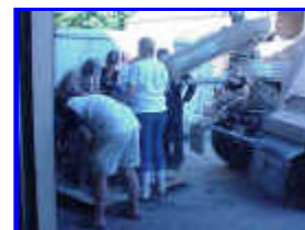
Pouring the concrete.