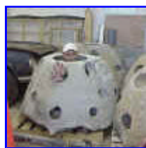
Hey, who is that?