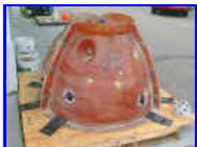
Reef Ball mold & materials before concrete is poured