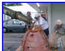
Charlie Watts with our generous volunteers pouring the stuff...we appreciate it guys!