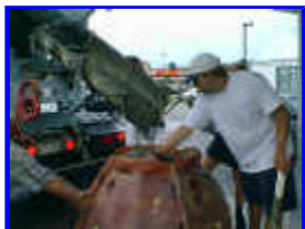
Kids, please don't try this at home!