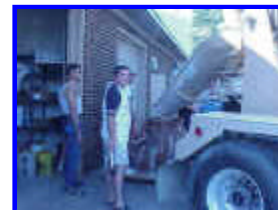
Backing up the truck.