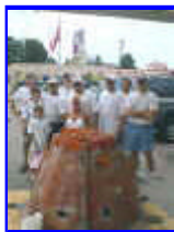
Hammerhead Members & Reef Ball Mold