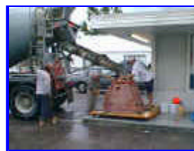
Pure dedication & determination... way to go guys!