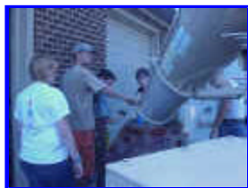
Getting ready to pour the concrete.